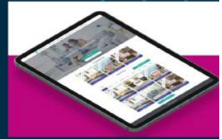
Proprietary platform to facilitate e-commerce