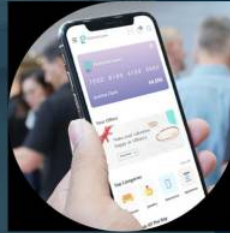
Seamless LTO across mobile, web & store