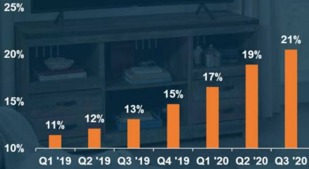
Rent-A-Center Business E-Comm. Share of Total Revenues