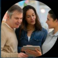
Foundational LTO Program