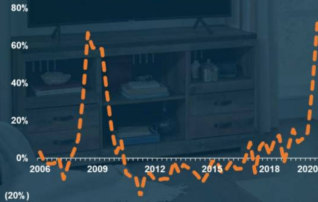
Percent of Banks Tightening Lending Standards