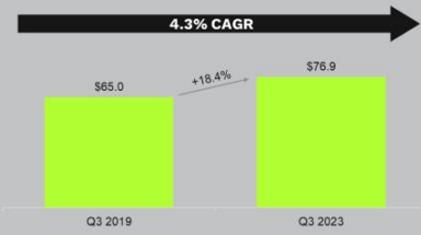
Rent-A-Center Past Due Rates 2,3 Trend