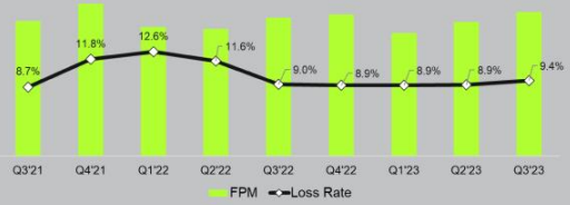
Acima Past Due Rates 2 Trend